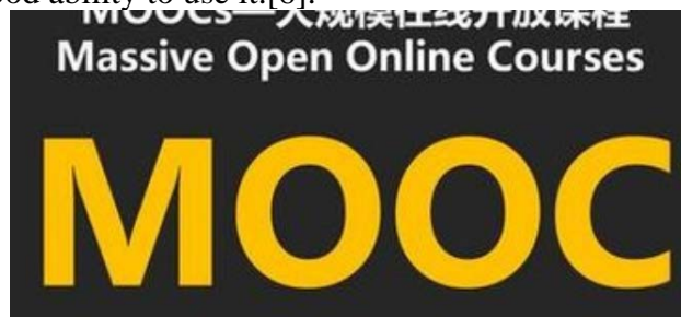
Figure 3 MOOC large-scale online course pictures

In order to construct the computer professional teaching mode based on the Internet application platform, teachers should also make flexible use of the Internet application platform to fully explore the advantages of computer professional teaching on the platform. Teachers can introduce online courses, extend classroom scenes, and allow students to study at home on holiday and in the dormitory. For example, in early 2020, because of the spread of the new coronavirus, many colleges and universities have postponed the start of school, in response to this situation, teachers can use "MOOC" to enable students to use computer, mobile phone classes, online learning professional knowledge; after learning the basic knowledge, students can complete the learning module task in the system, online submission of homework; teachers can use the whole process of monitoring students' learning behavior, evaluation and feedback on the process of students' practice and results, put forward opinions and suggestions, so that students can "not go to the door" to acquire knowledge and form a good ability to use it.[6].