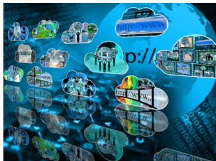
Figure 1 Rich Internet teaching resources

Advantage 1: rich in teaching resources. The scope of computer professional knowledge is relatively wide, and comprehensive and practical, teachers should cultivate students' ability to use computer technology, traditional teaching methods will make students feel boring and boring, which is not conducive to improving students' learning efficiency. After using the Internet application platform, teachers can combine the various resources in the platform to carry out classroom teaching activities through video, picture, audio and so on (figure 1), which can attract students' attention and stimulate students' interest in learning. In addition, teachers can also enable students to simulate the operation on the platform, can learn to do while doing, with the class to exercise students' ability to use, to consolidate the classroom teaching results [1].